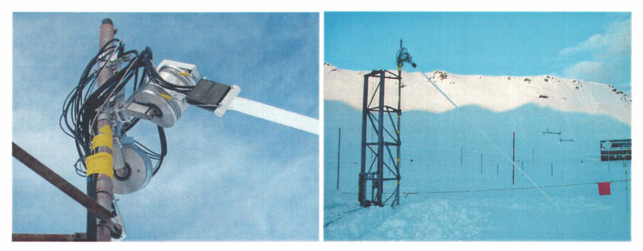
Figure 1 : The cable sensor system at Weissfluhjoch Davos (2550 m): the new suspension of the sloping cable (left), which is now installed in a 45° angle (right).

The new set of 4 flat-band cables was installed by FZK and SLF/WSL in November 2002, and the system has been running without any severe problems since December 2002. It is visited once a week. To date, the new set-up of the sloping cables looks very promising. In addition to the new sloping cable, 2 horizontal cables have already been placed on the snow surface, and one more is planned. Sloping dummy cables have been installed, which will be used during spring to study the influence of the cables on the liquid water flow by tracer experiments.