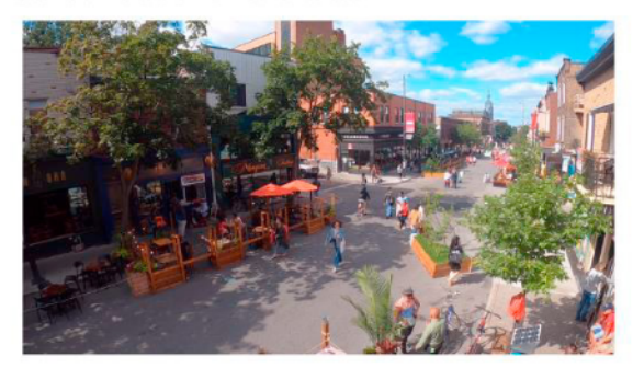
Site 2b : 3rd and 4th avenue

Site 1b : Drolet and Henri-Julien streets