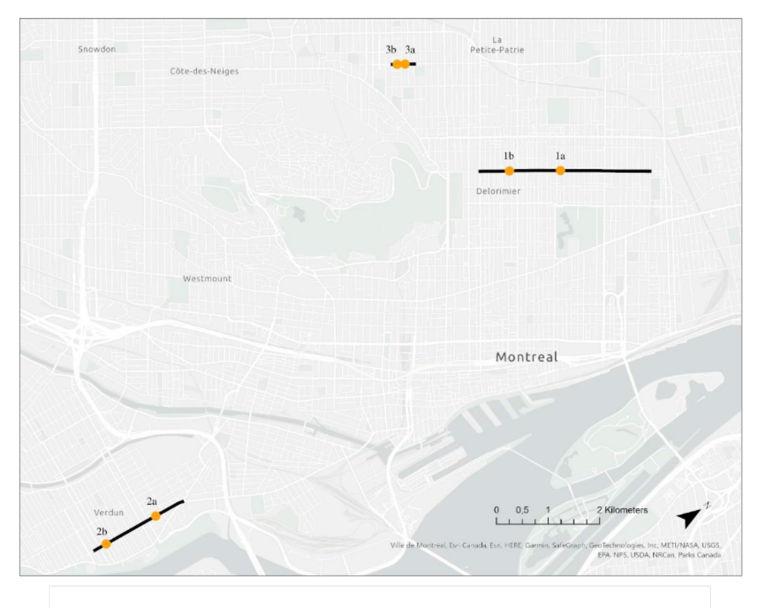
Fig. 1. Study sites