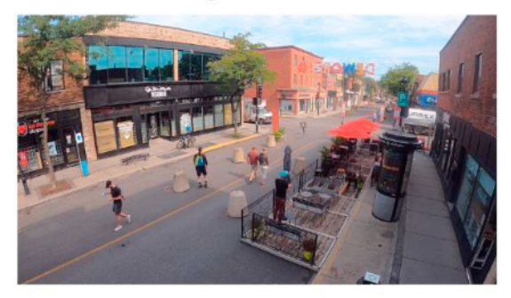
Site 3a : Champagneur and Outremont avenues

Site 1b : Drolet and Henri-Julien streets