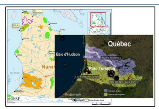
Fig.1. Study site, Turjusuk Park

The experimental sites are located on Turjusuk Park near the Hudson Bay cost (Qc, Canada) in Nunavik region: Sheldrake and Nastapoka basins ( Fig.1 ). It is a zone of discontinuous permafrost located at the tree line.