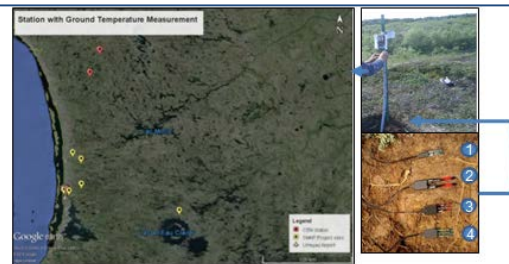
Fig.2. (a) Experimental sites, (b) Sensors installation

27 sites were selected to do analysis ( Fig.2 ). They include 18 temporary Stations (SMAP project) and 9 CEN meteorological stations.