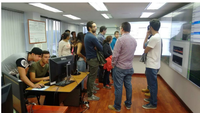
Figure 1. IGCP636 2016 field trip: visit to the volcanological and seismological Observatory in Manizales.

The second annual meeting was held in Santiago de Chile, at Universidad de Chile (Fig. 4), hosted by CEGA. Africa joined the research group at this meeting, with a PhD candidate and a researcher that participated to the meeting by giving a talk and presenting a poster, respectively, about the assessment of geothermal resources in Madagascar. The IGCP636 team visited CEGA laboratories, where sophisticated instruments will allow to implement and operate a set of world-