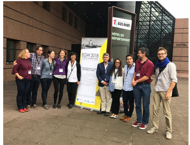
Figure 6. IGCP636 annual meeting 2018: Strasbourg, 6 th European Geothermal Workshop.

The third IGCP636 annual meeting was organized in France, with a secondary objective to attend the 6 th European Geothermal Workshop (EGW) in Strasbourg (Fig. 6). Four researchers of the IGCP636 team also had a meeting at the UNESCO HQ in Paris with several UNESCO National Delegations (Canada, Madagascar, Colombia and Iceland), as well as with Özlem Adiyaman Lopes, the responsible for the IGCP projects (Fig. 7). Delegates provided useful comments and suggestions for future research goals and their dissemination throughout the society. The whole IGCP636 research team then met at BRGM office in Orléans to share and discuss the results obtained during the last year, to plan future activities, and to visit the BRGM experimental