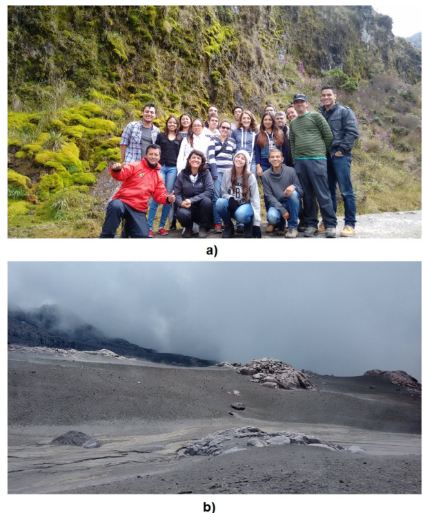
Figure 3. IGCP636 2016 field trip: (a) main researchers and students at Los Nevados natural national park, b) Valle de Las Tumbas (4300 m a.s.l.), one of the stops where lava and pyroclasts can be observed.