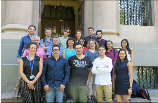
Figure 4. IGCP636 annual meeting 2017: Universidad de Chile, Santiago.

class laboratories. The instruments are used by researchers and students from CEGA, collaborating institutions in Chile, and are also available to the international geothermal community ( http://www.cega.ing.uchile.cl/en/laboratorios/ ). A 2-day field trip was organized to San Jos del Maipo and San Felipe-Los Andes in the Valle de Aconcagua geothermal areas by students and professors from CEGA (Fig. 5). In the first day, sampling of thermal waters was conducted and exhaustive explanations of structural geology were given by students working on those study areas. Groundwater circulating through a fractured rock massif and fault zones could be clearly observed in the second day.