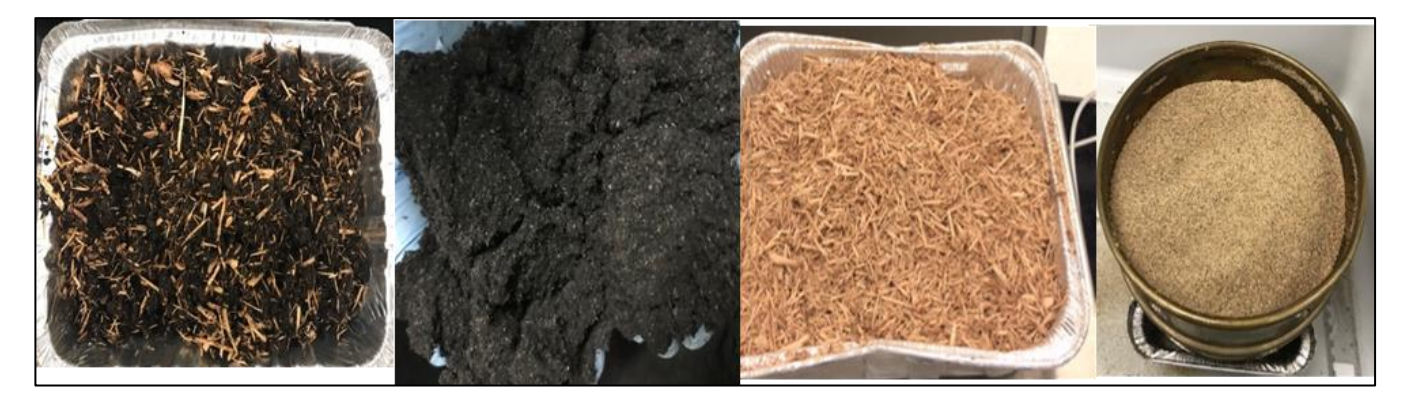
Figure 2. Filtering materials (from (left) to (right)): woodchips, biochar, sphagnum peat moss, and sand.