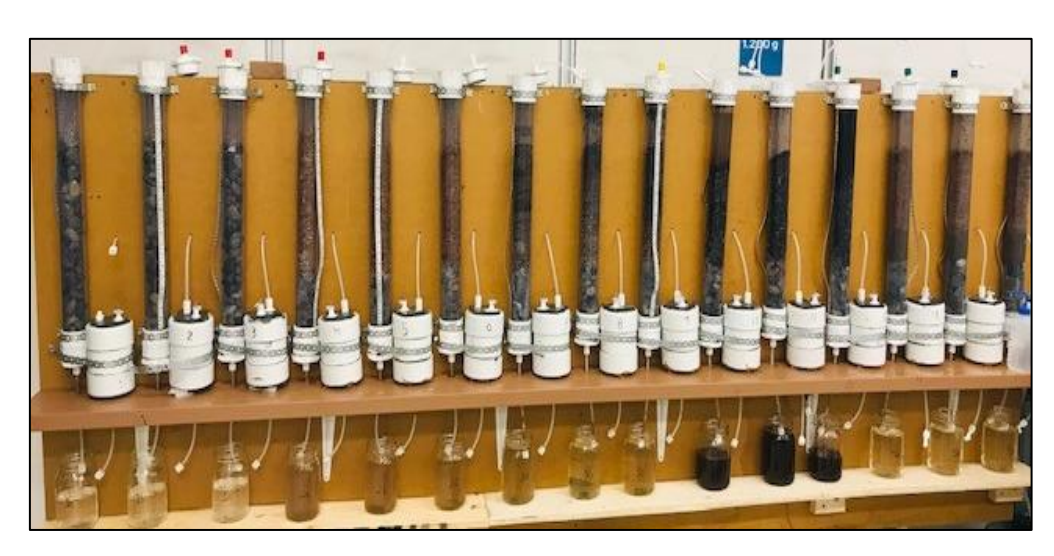
Figure 1. PVC columns in IRDA's laboratory.

A fifteen-PVC-column (5 cm in diameter and 50-cm long; Figure 1) set up housed at the Research and Development Institute for the Agri-Environment (IRDA) facility in Québec City (QC, Canada) was used to treat synthetic dairy cow manure during 3 weeks between 17 August and 4 September 2020. Synthetic manure was used in order to have a known and consistent concentration at laboratory scale. At the base of the filters, a 0.2 mm mesh was installed to avoid any material loss. To collect leachate samples, the bottom of the columns was connected to a flexible tube, linked to a 1000 mL container.